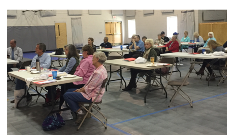
Above: Attendees at the Get Up and Go event